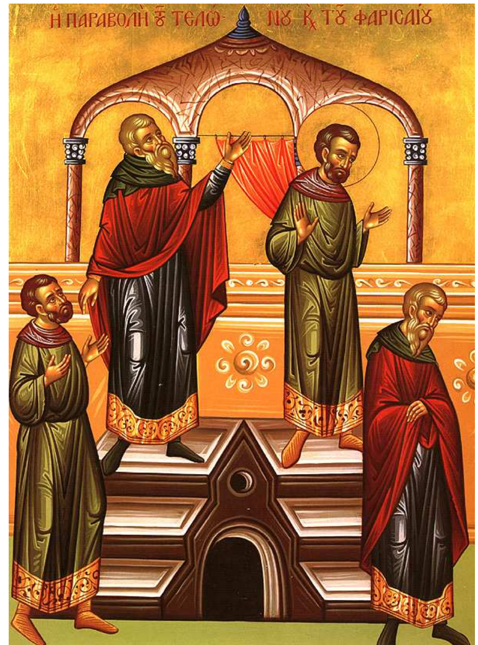
THE PUBLICAN AND THE PHARISEE